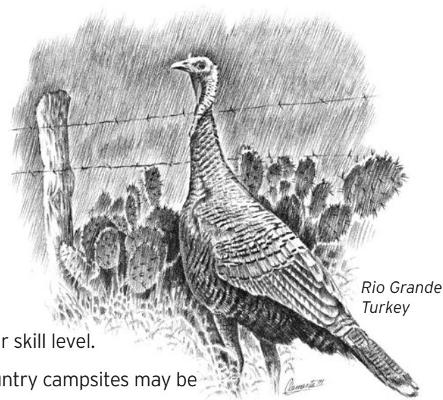
Rio Grande Turkey

Practice trail courtesy. Remain on designated trails and be respectful of other trail users. Bikers yield to hikers; everyone yields to horses.